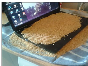
New Craze Starts To Wipe Out Slow Computers Across The US (Turbo Your PC)