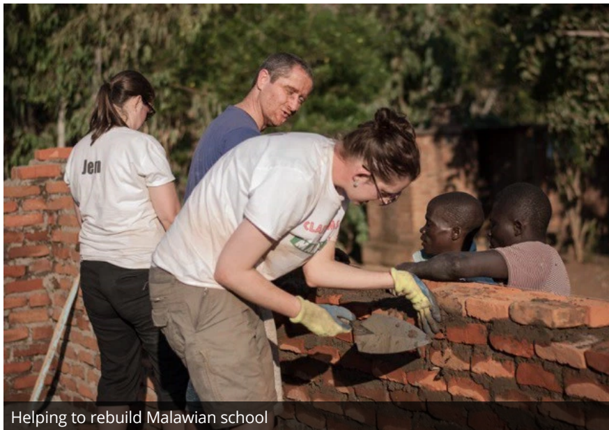
Helping to rebuild Malawian school

They had already given their lives to teaching in this country – and then they decided to take a more hands-on approach to education.