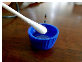
People amazed at the real reason behind slow computers (Comments for Tech News)