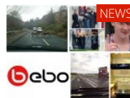
These were the most read P&J stories of 2015