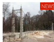
VIDEO: Can historic bridge over River Dee withstand Storm Frank floods?