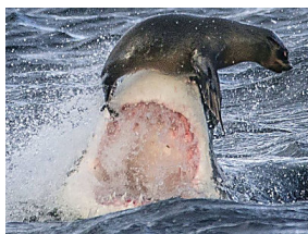
How This Seal Escapes This Shark Will Leave You Breathless