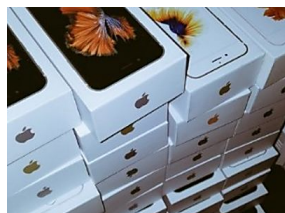
Leftover iPhone stocks worth £619 selling for under £40 (MegaBargain 24)