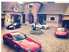
Four UK Students Reveal their Secret for Making Millions