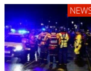
VIDEO: Police continue search for car seen floating down River Dee