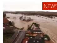
VIDEO: Drone footage shows extent of flooding over Aberdeenshire