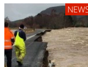
WATCH: Driver skilfully crosses road ripped apart by flood torrents